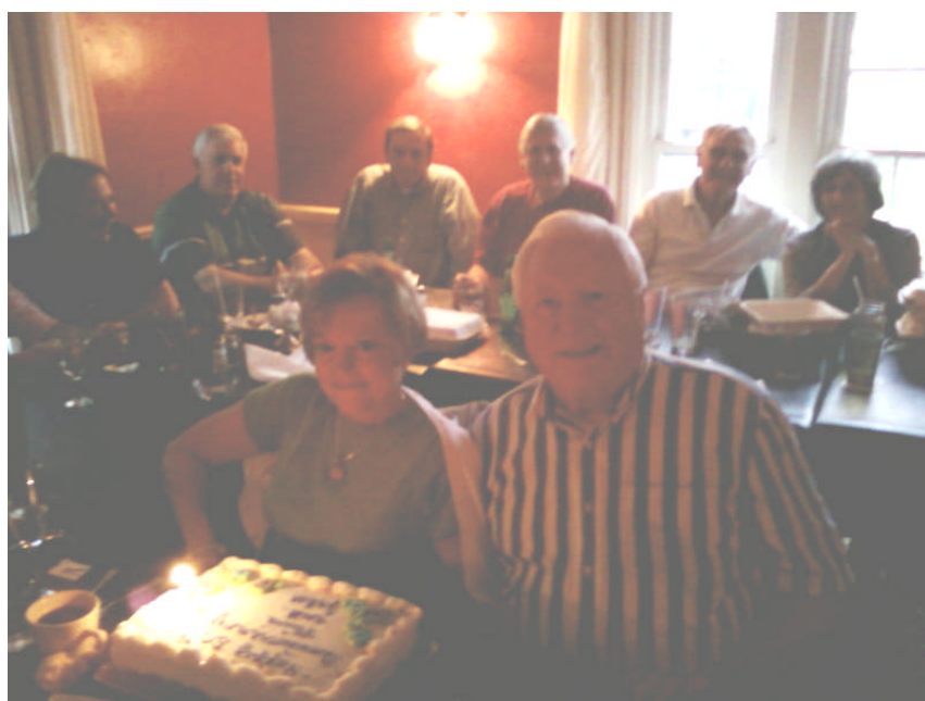
Congratulations to the Nun's on their 50th Anniversary